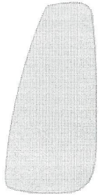
Right Arm Pad