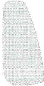
Left Arm Pad